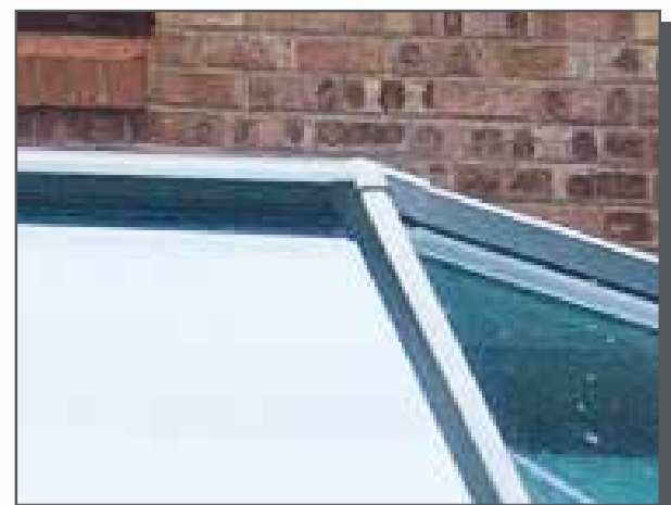
Neat ridge ends

Triple layer protection at the ridge end, with glazing compression trims, a weathering shield and a secure-fit cover