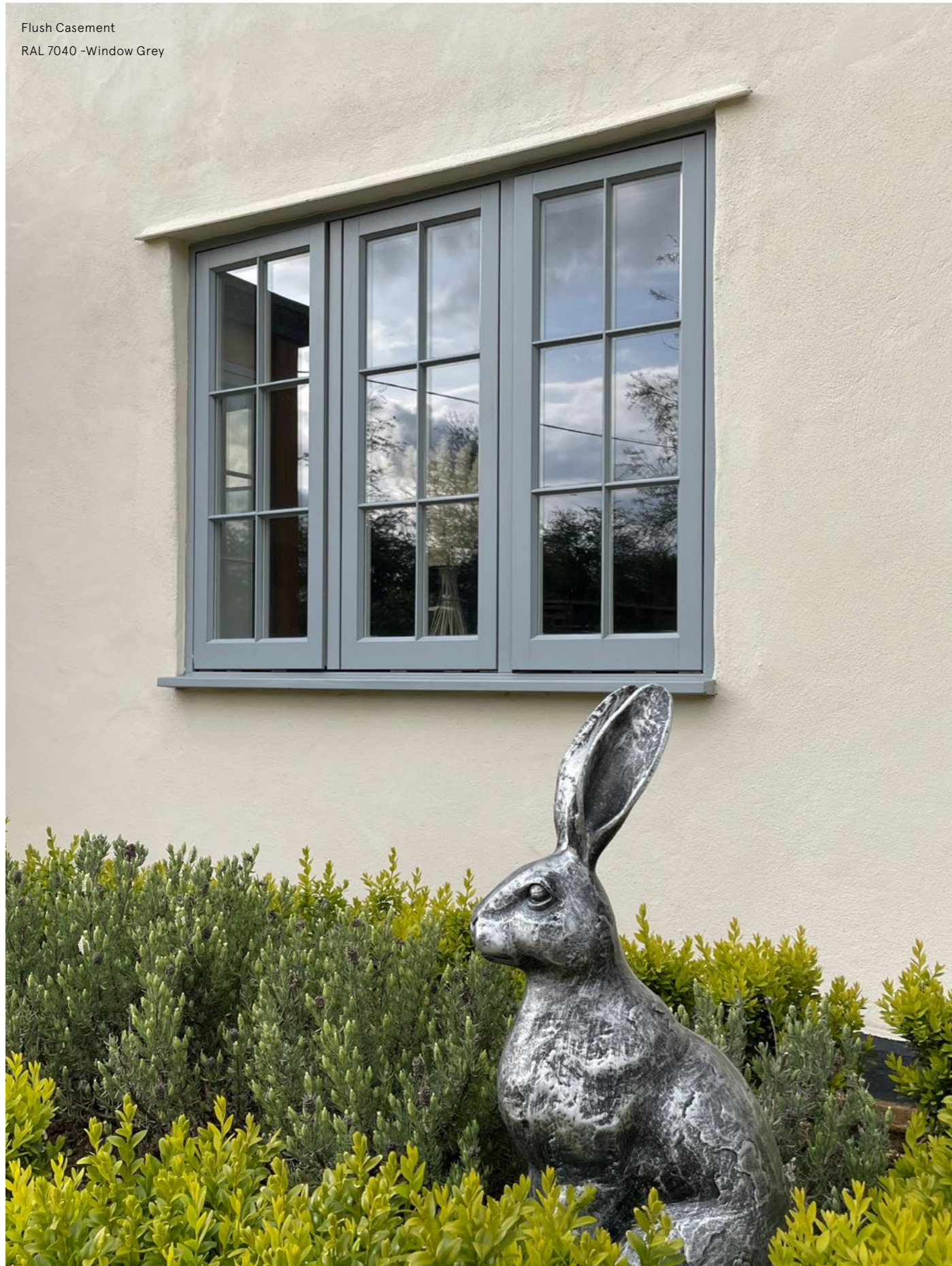
Flush Casement RAL 7040 - Window Grey