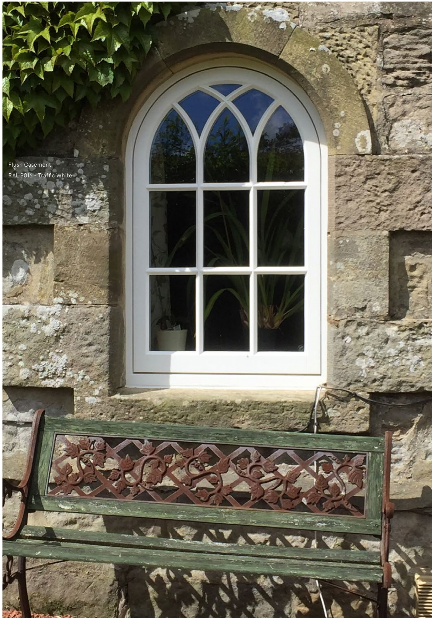
Flush Casement RAL 9016 - Traffic White