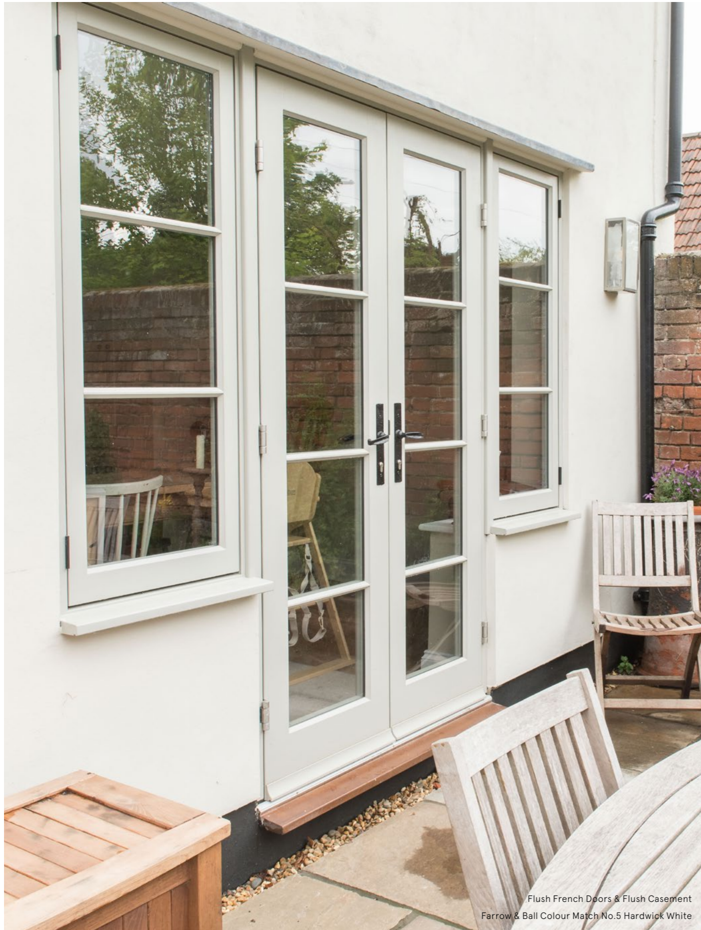
Flush French Doors & Flush Casement Farrow & Ball Colour Match No.5 Hardwick White