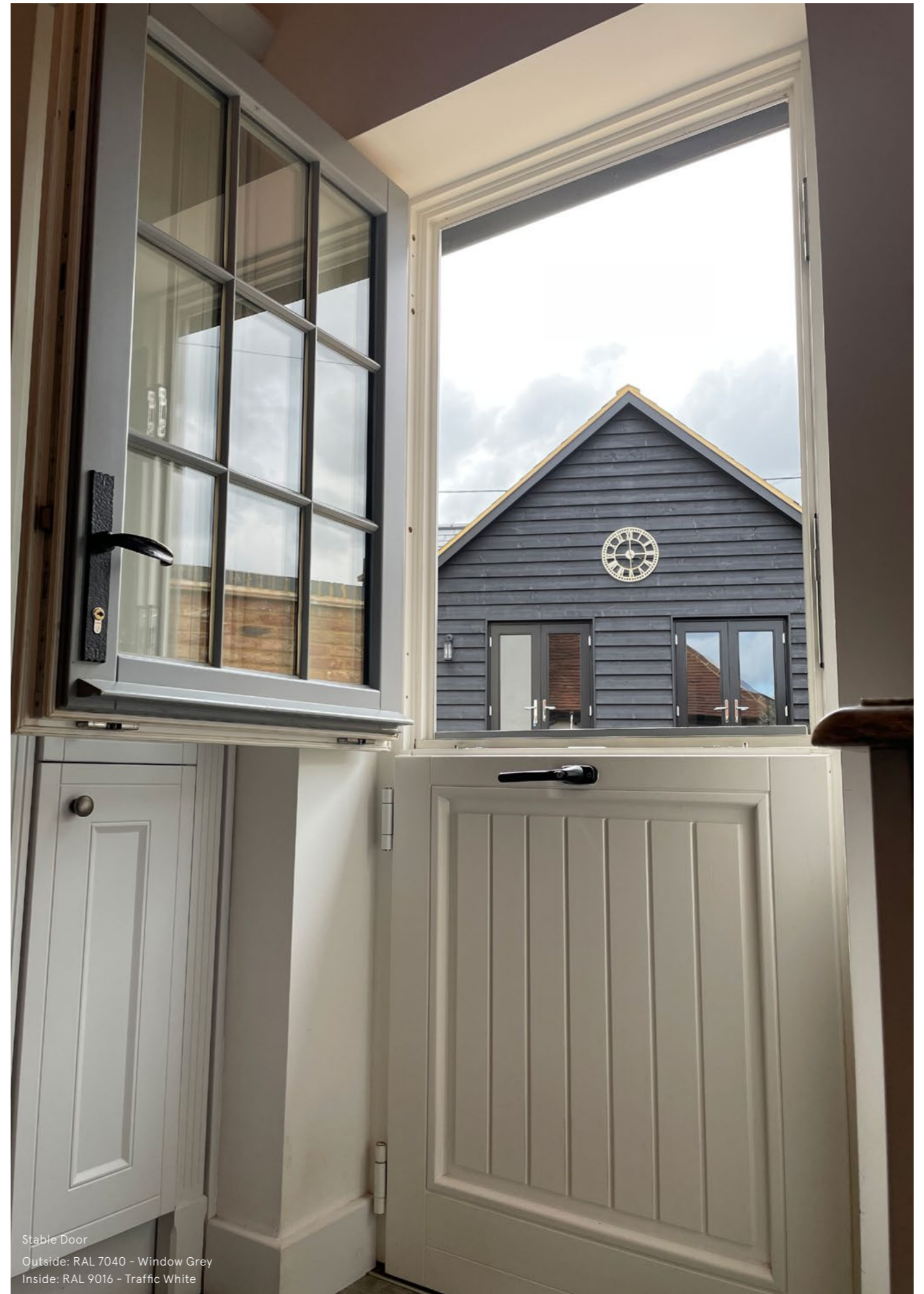
Stable Door Outside: RAL 7040 - Window Grey Inside: RAL 9016 - Traffic White