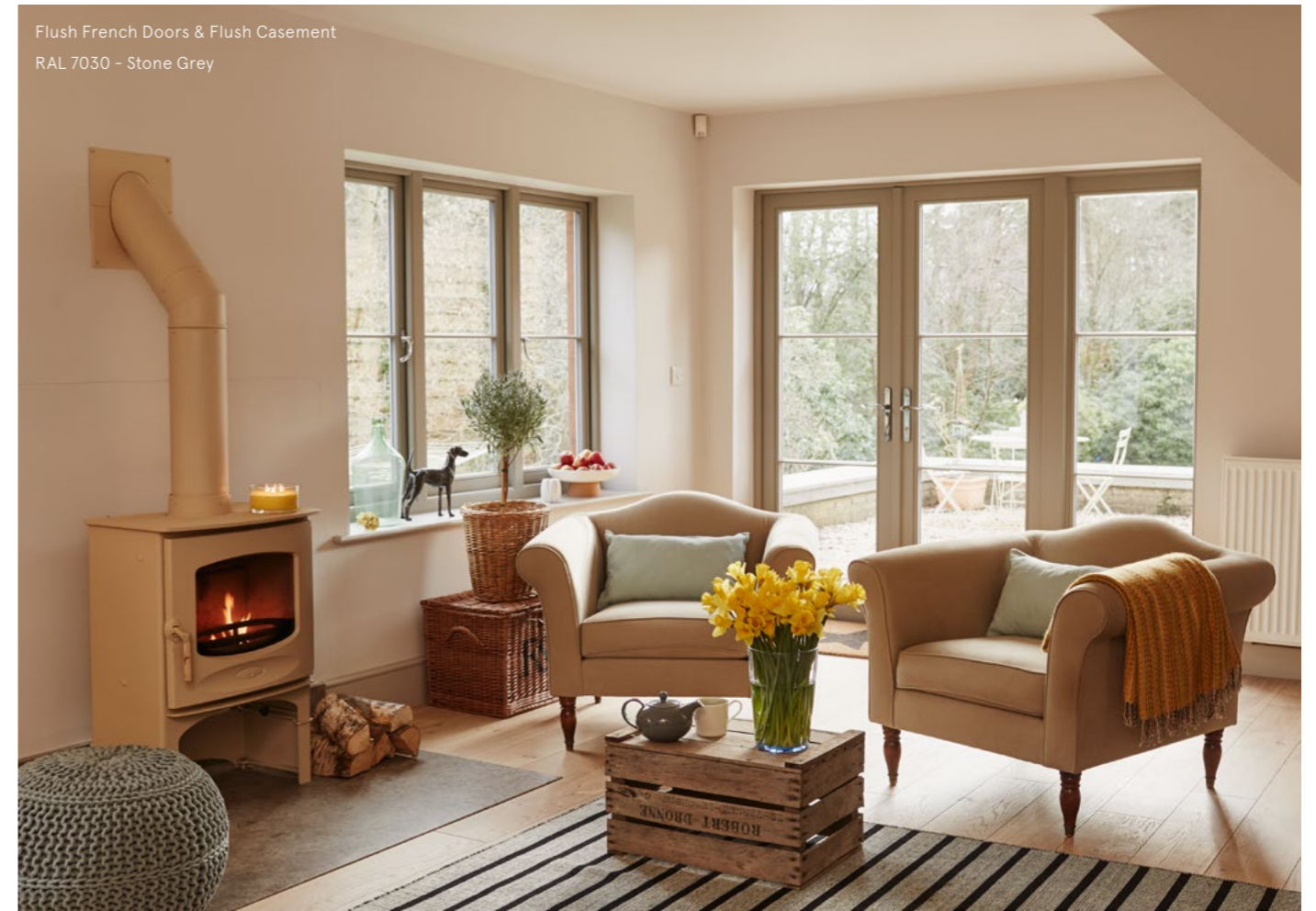
Flush French Doors & Flush Casement RAL 7030 - Stone Grey