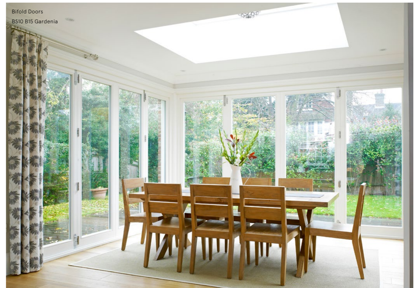
Bifold Doors BS10 B15 Gardenia