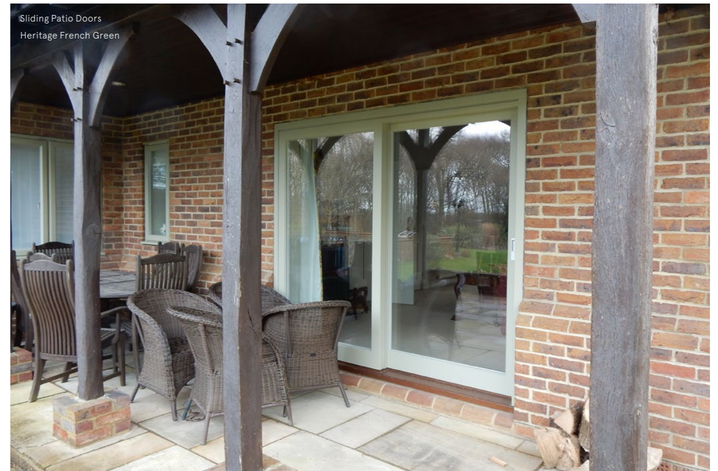
Sliding Patio Doors Heritage French Green