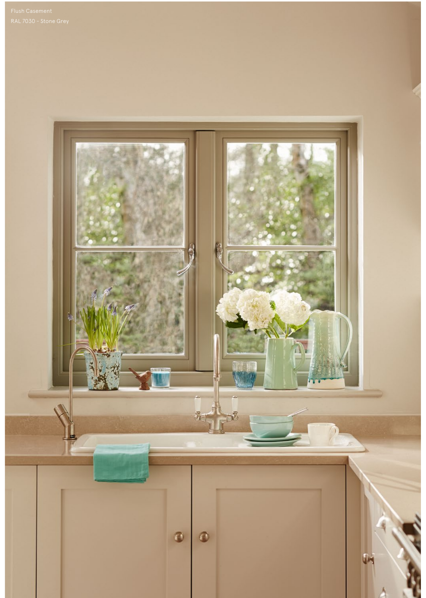
Flush Casement RAL 7030 - Stone Grey