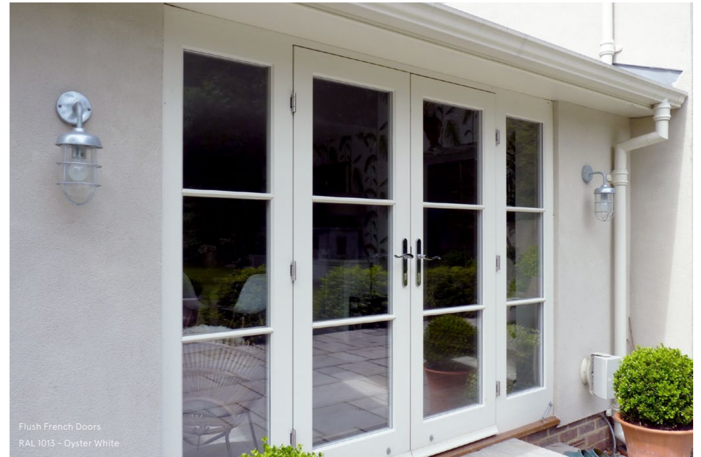
Flush French Doors RAL 1013 - Oyster White