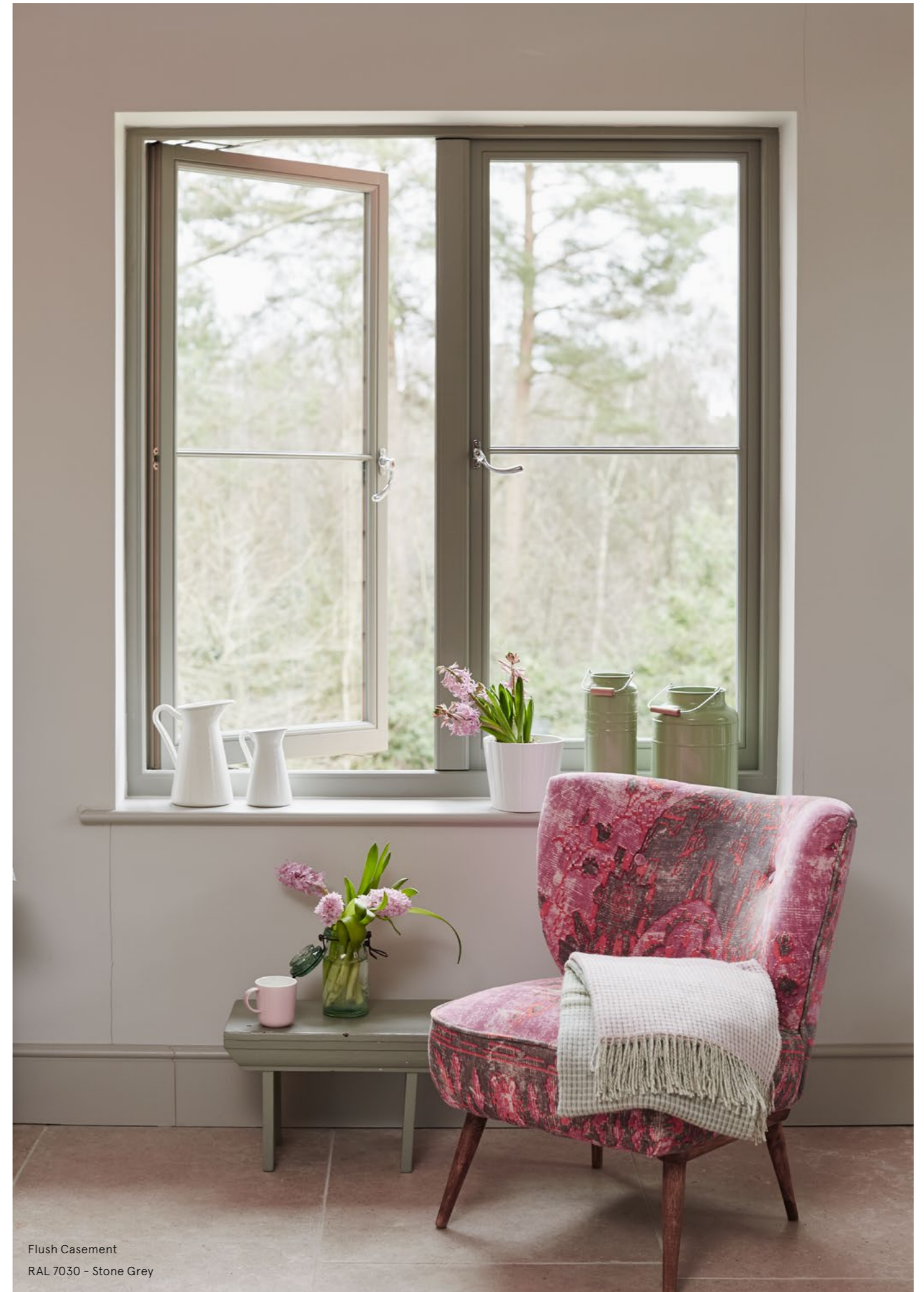
Flush Casement RAL 7030 - Stone Grey