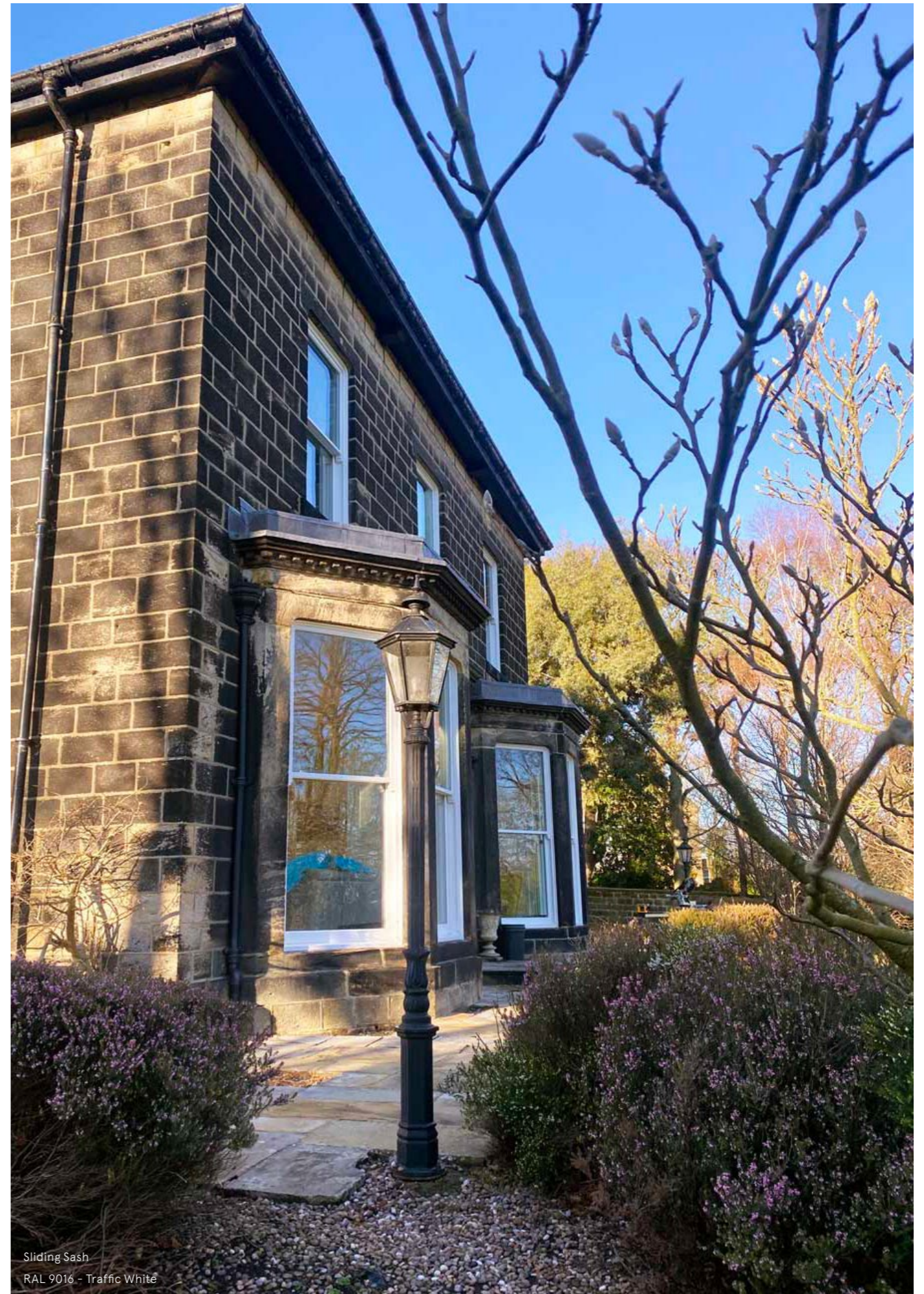
Sliding Sash RAL 9016 - Traffic White