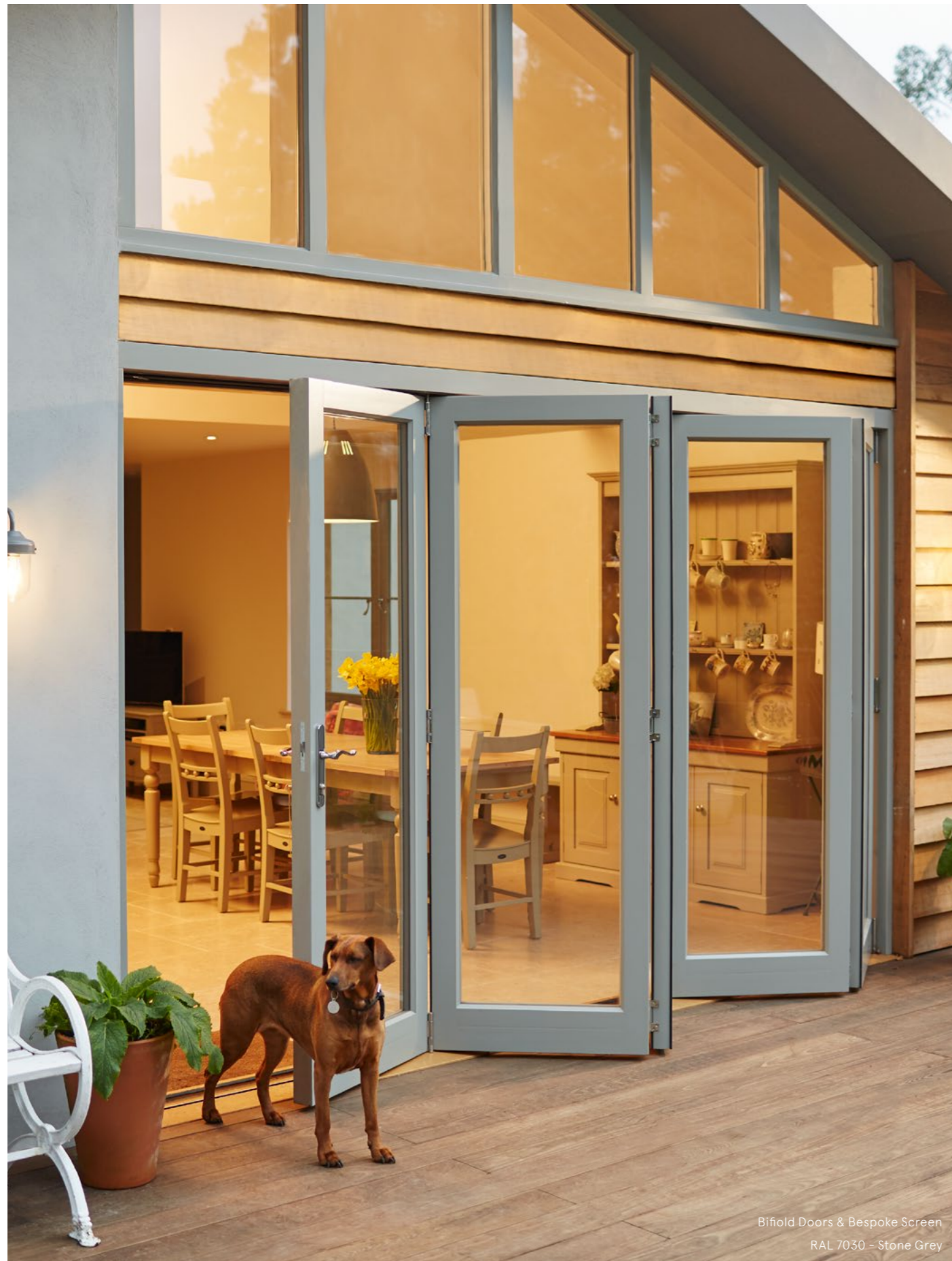
Bifold Doors & Bespoke Screen RAL 7030 - Stone Grey