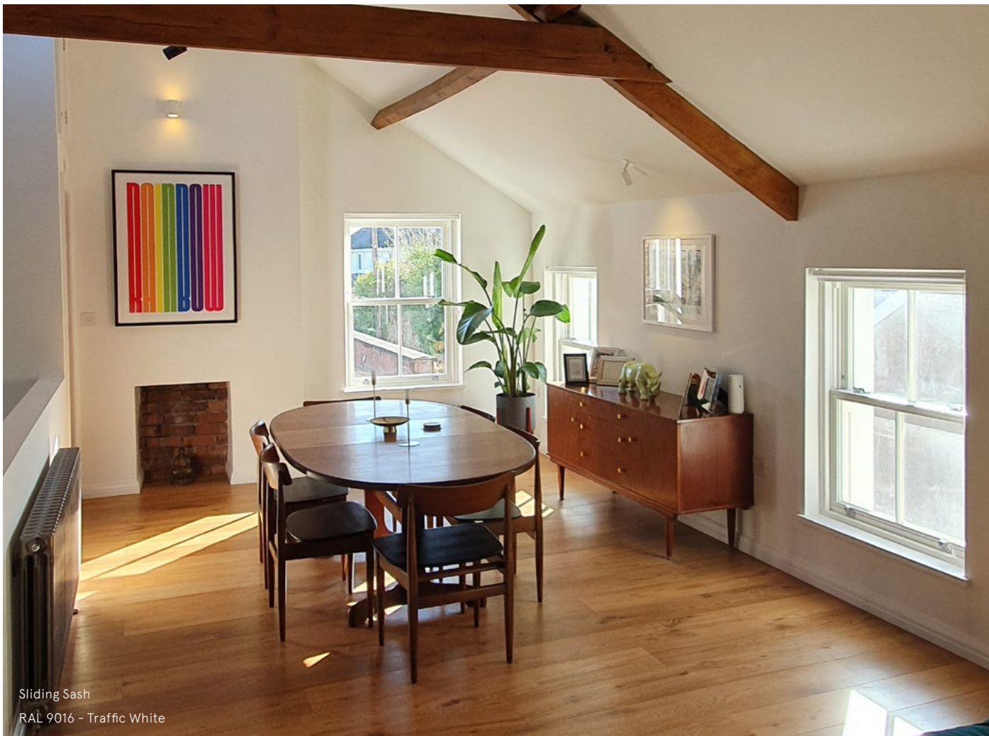
Sliding Sash RAL 9016 - Traffic White