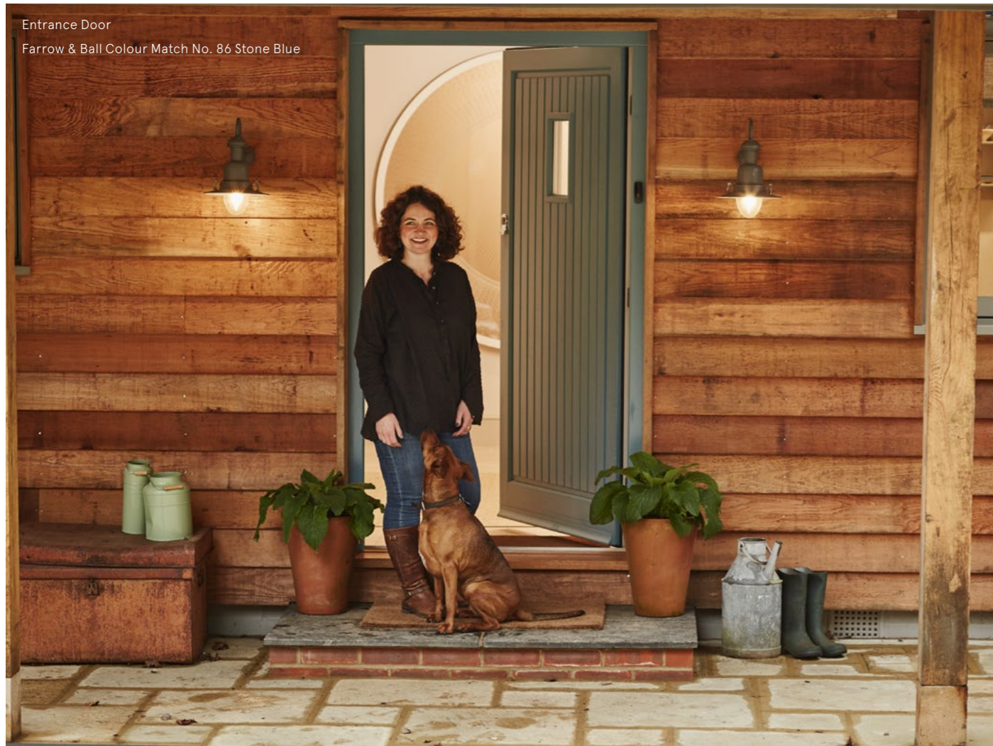
Entrance Door Farrow & Ball Colour Match No. 86 Stone Blue