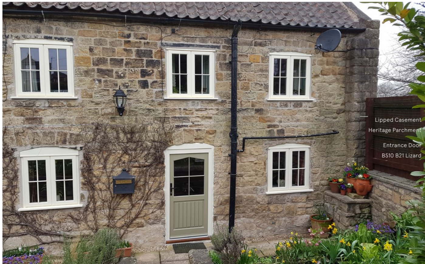
Lipped Casement Heritage Parchment Entrance Door BS10 B21 Lizard