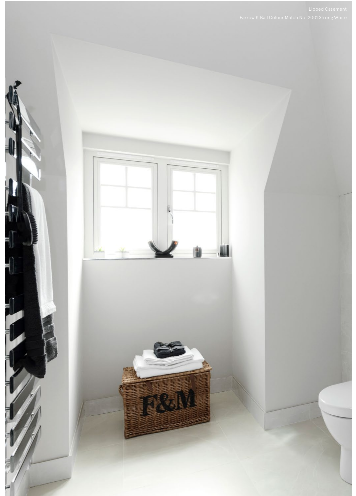
Lipped Casement Farrow & Ball Colour Match No. 2001 Strong White