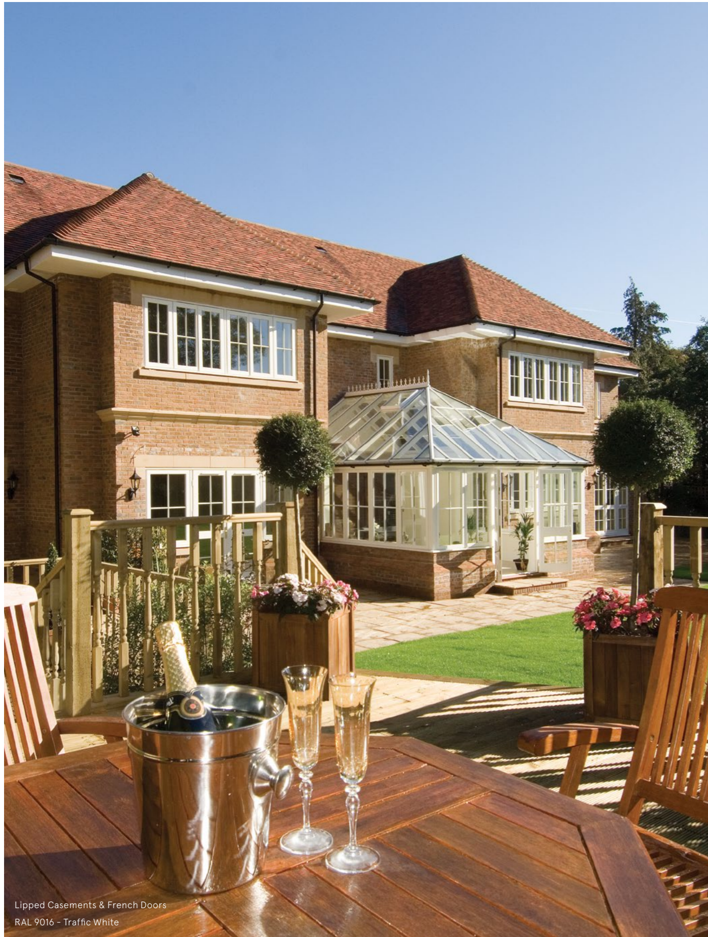
Lipped Casements & French Doors RAL 9016 - Traffic White