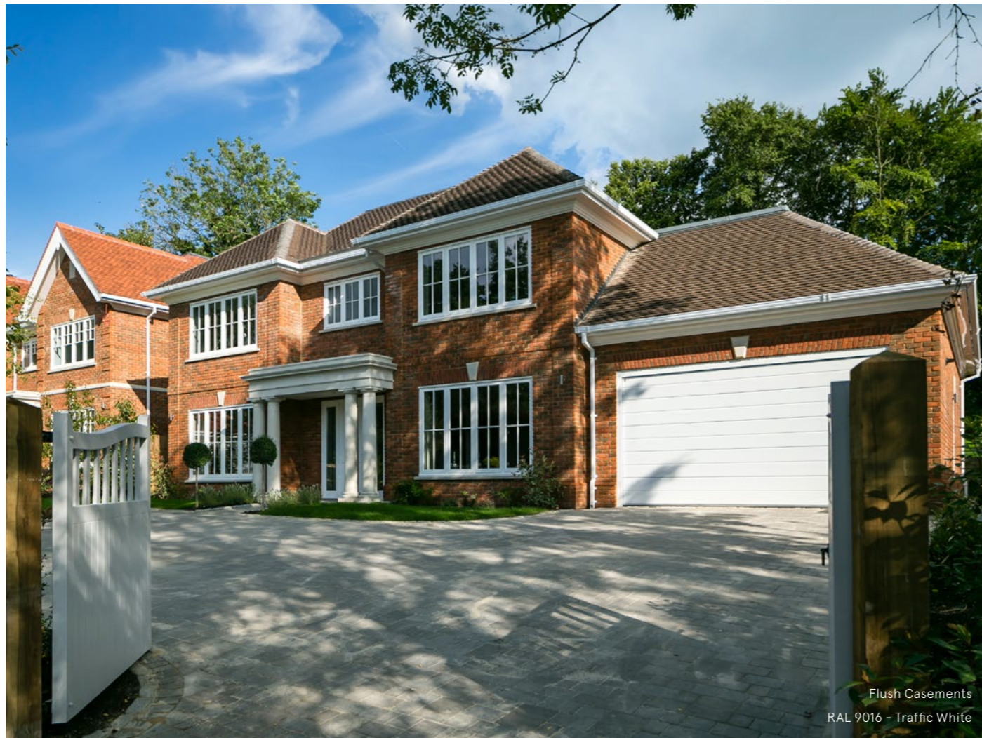
Flush Casements RAL 9016 - Traffic White