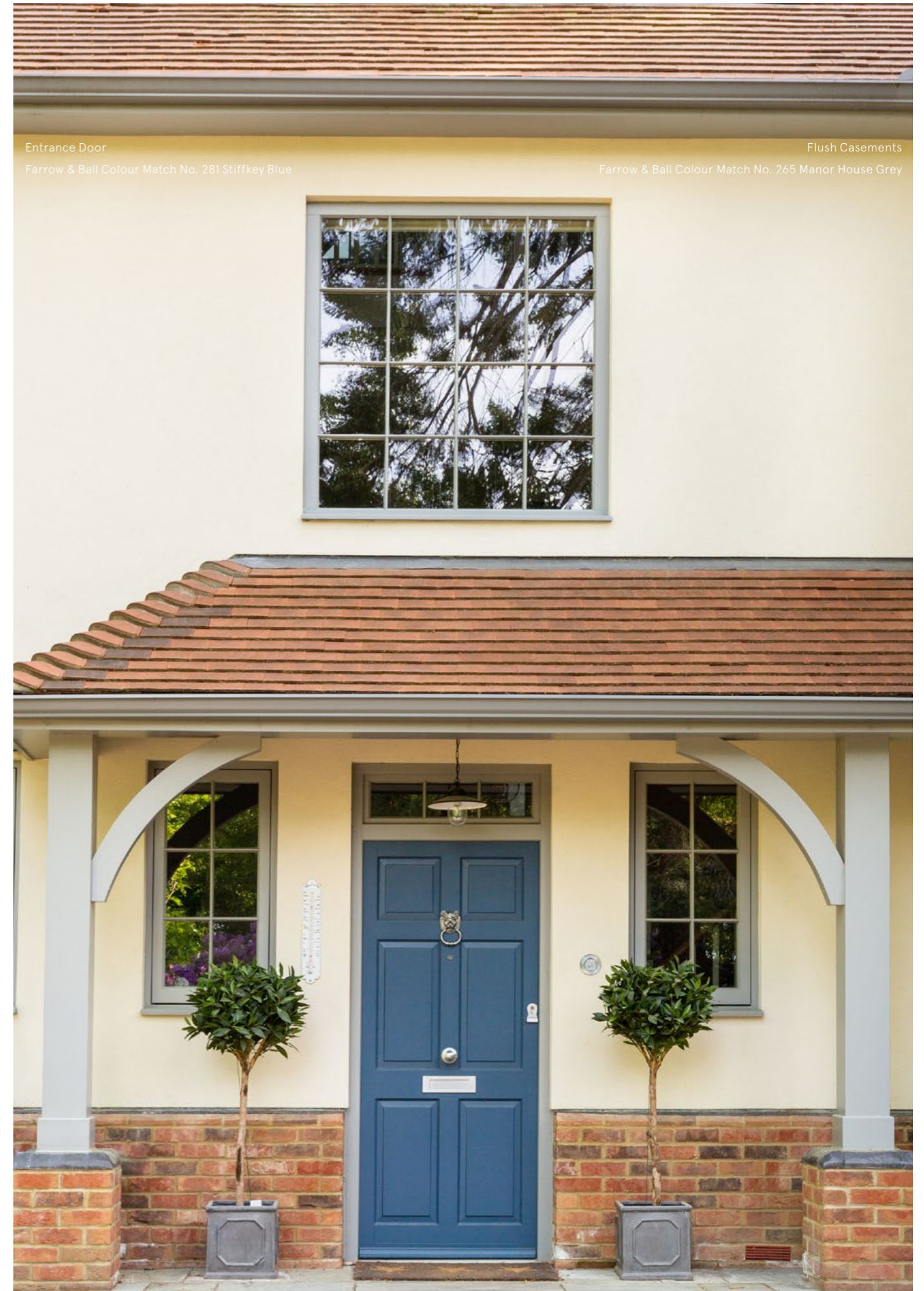
Entrance Door Farrow & Ball Colour Match No. 281 Stiffkey Blue