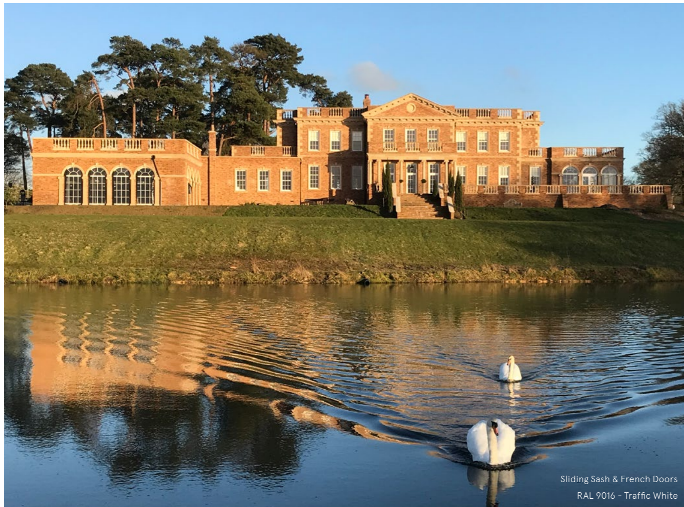
Sliding Sash & French Doors RAL 9016 - Traffic White