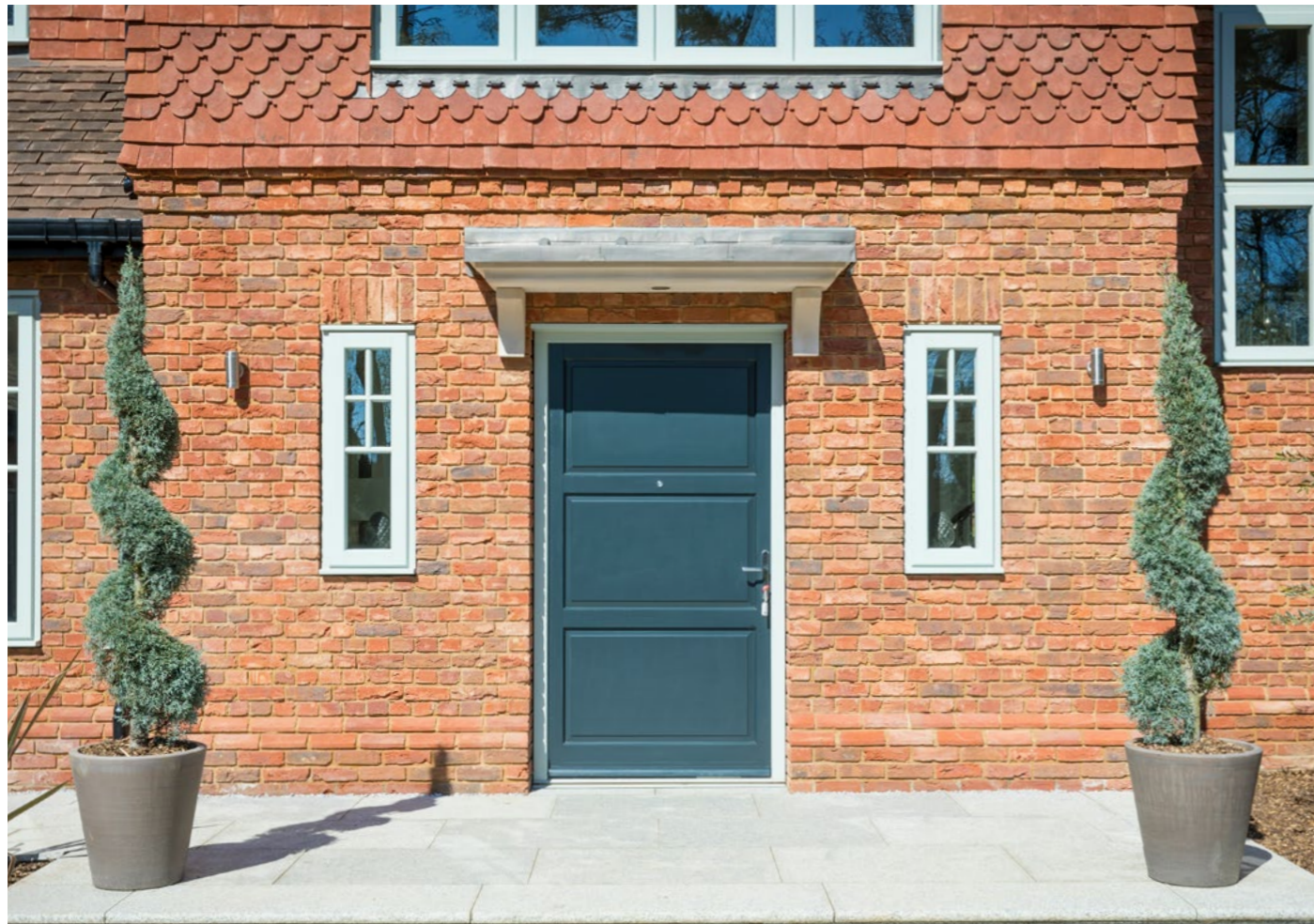
Lipped Casements Farrow & Ball Colour Match No. 22 Light Blue