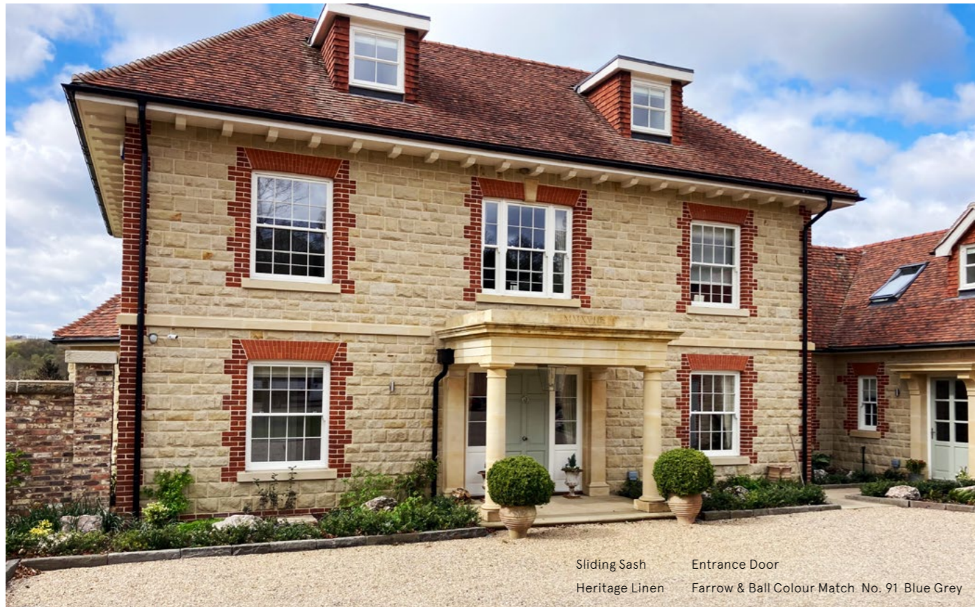
Sliding Sash Entrance Door Heritage Linen Farrow & Ball Colour Match No. 91 Blue Grey