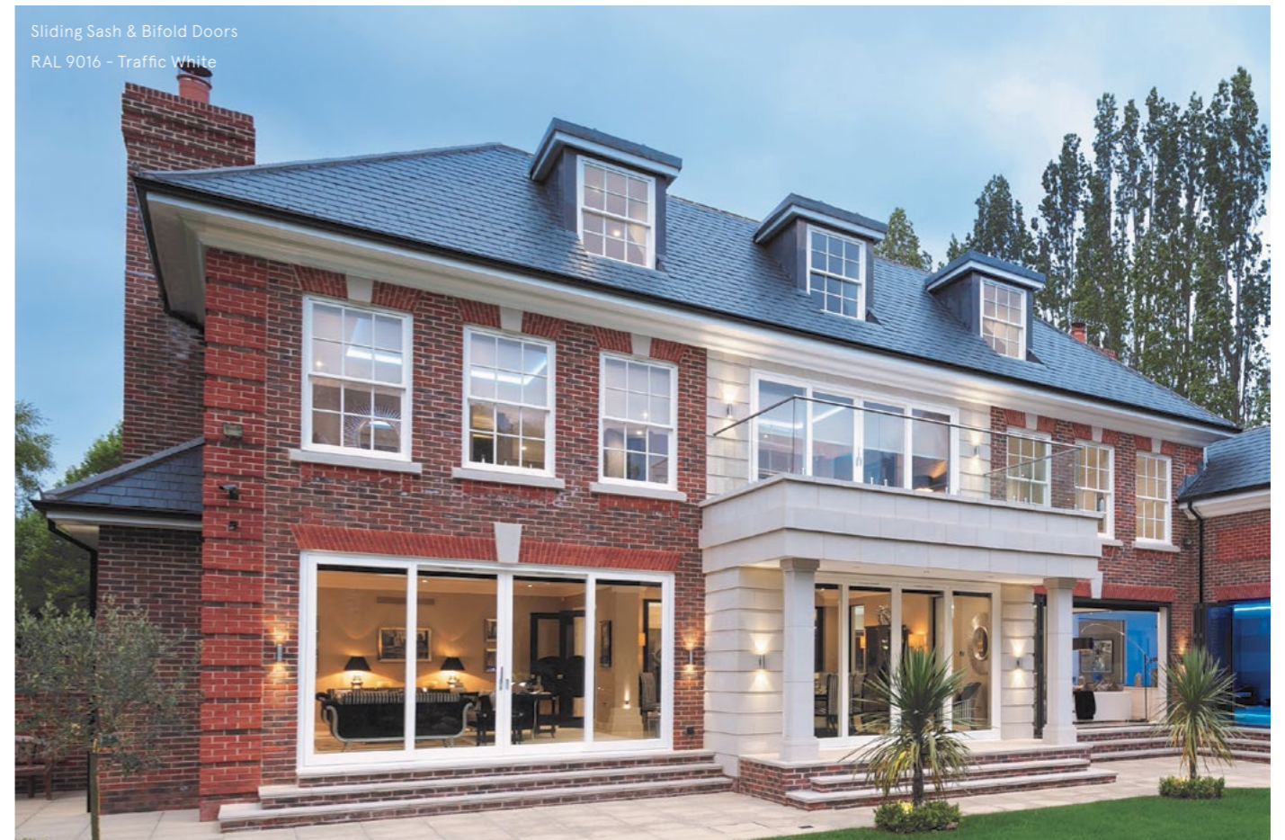
Sliding Sash & Bifold Doors RAL 9016 - Traffic White