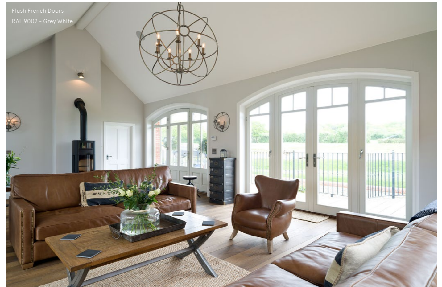
Flush French Doors RAL 9002 - Grey White