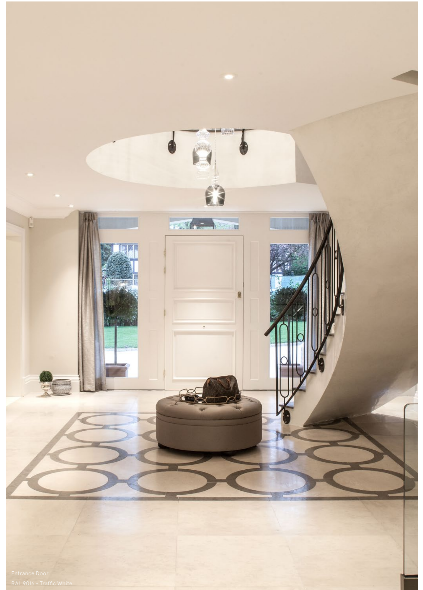
Entrance Door RAL 9016 - Traffic White