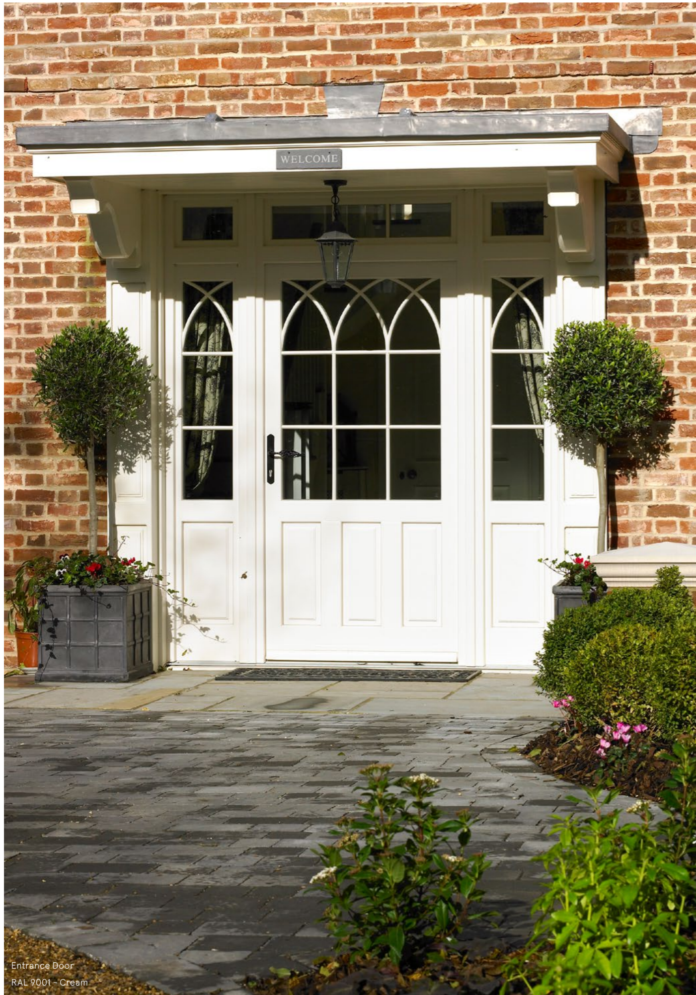
Entrance Door RAL 9001 - Cream