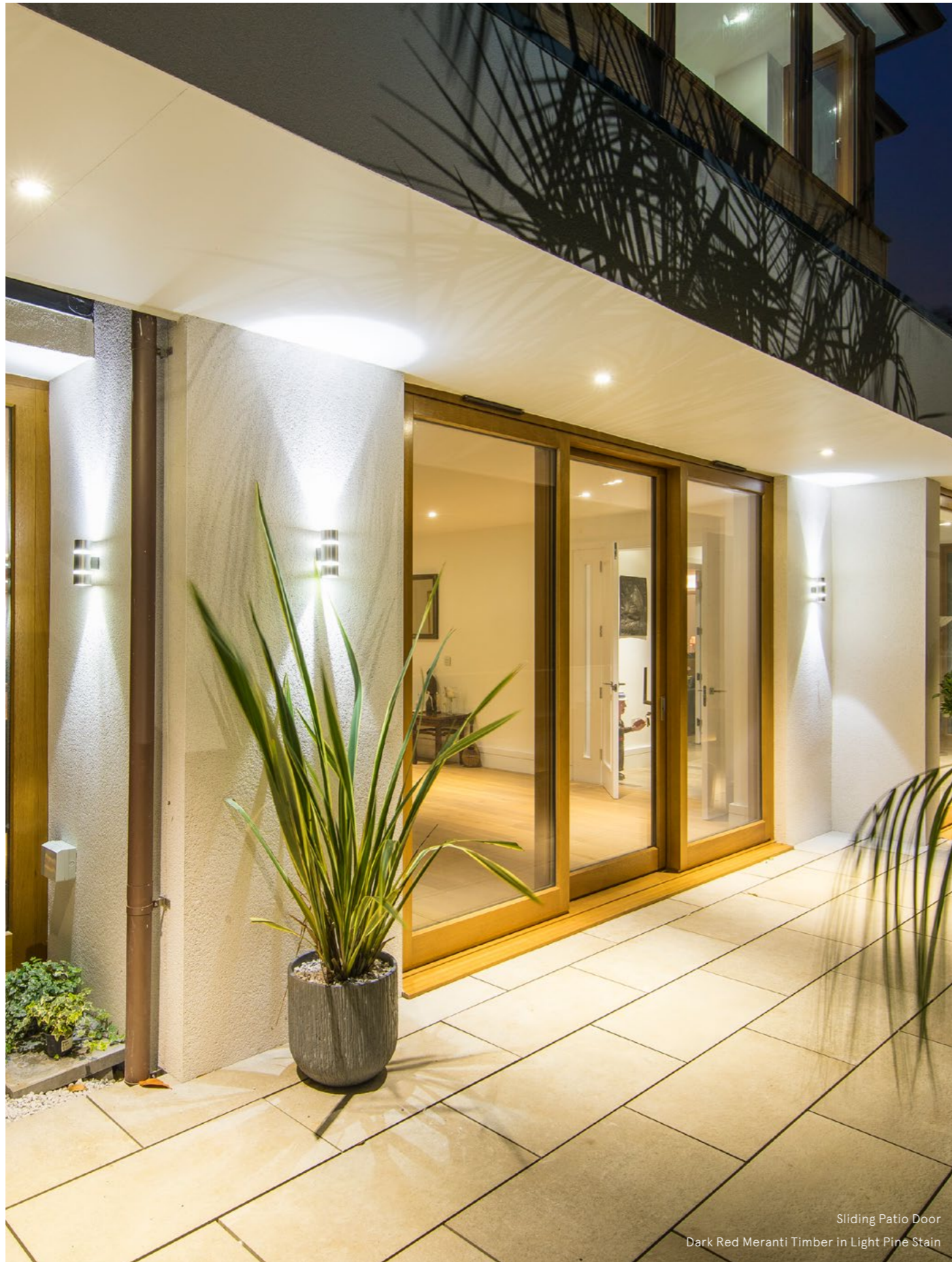
Sliding Patio Door Dark Red Meranti Timber in Light Pine Stain