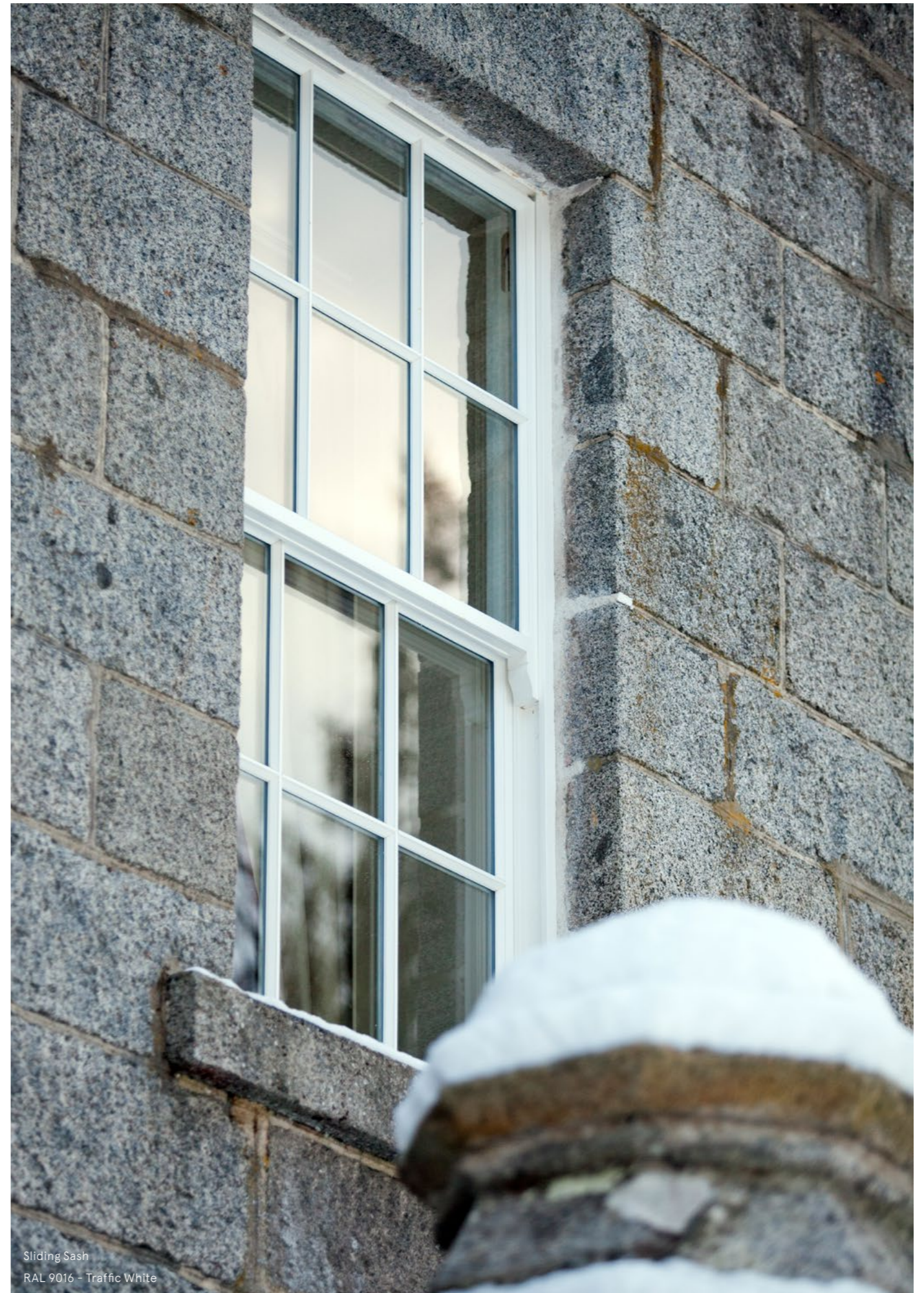
Sliding Sash RAL 9016 - Traffic White