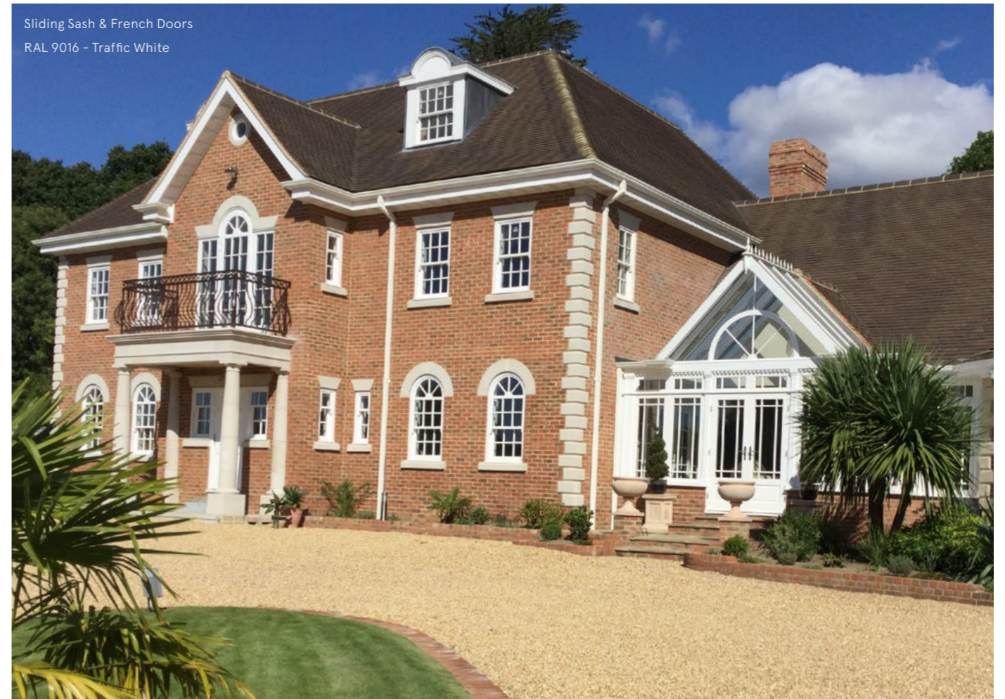
Sliding Sash & French Doors RAL 9016 - Traffic White