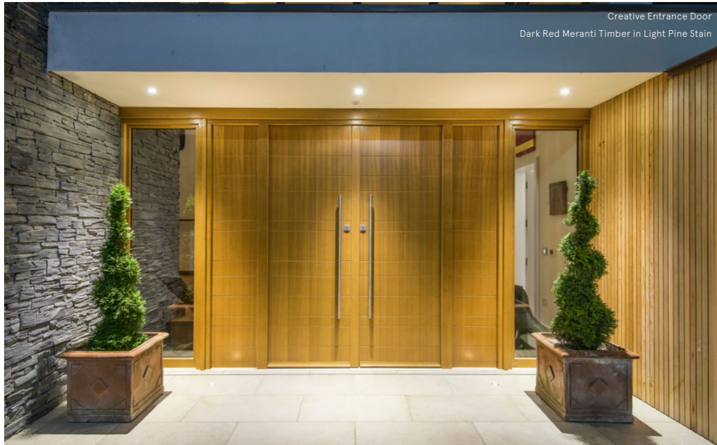
Creative Entrance Door Dark Red Meranti Timber in Light Pine Stain