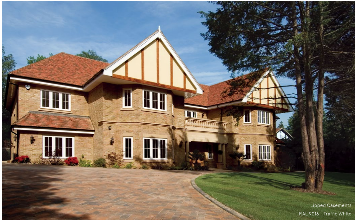
Lipped Casements RAL 9016 - Traffic White