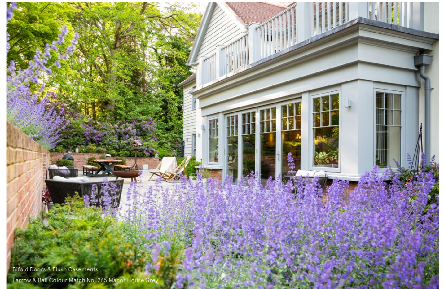
Bifold Doors & Flush Casements Farrow & Ball Colour Match No. 265 Manor House Grey