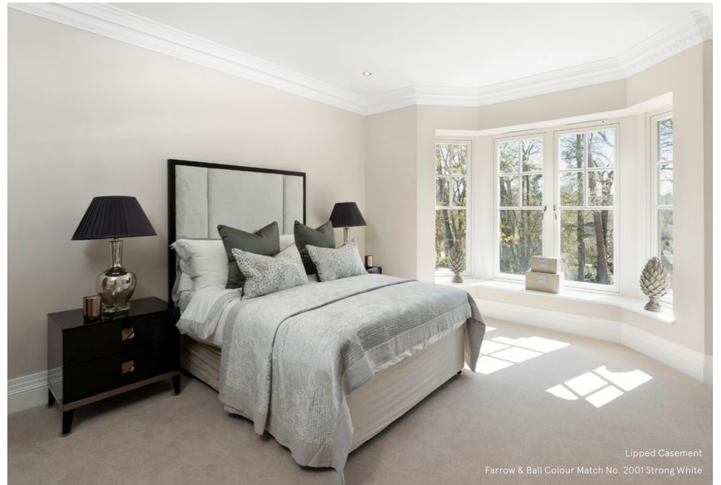
Lipped Casement Farrow & Ball Colour Match No. 2001 Strong White