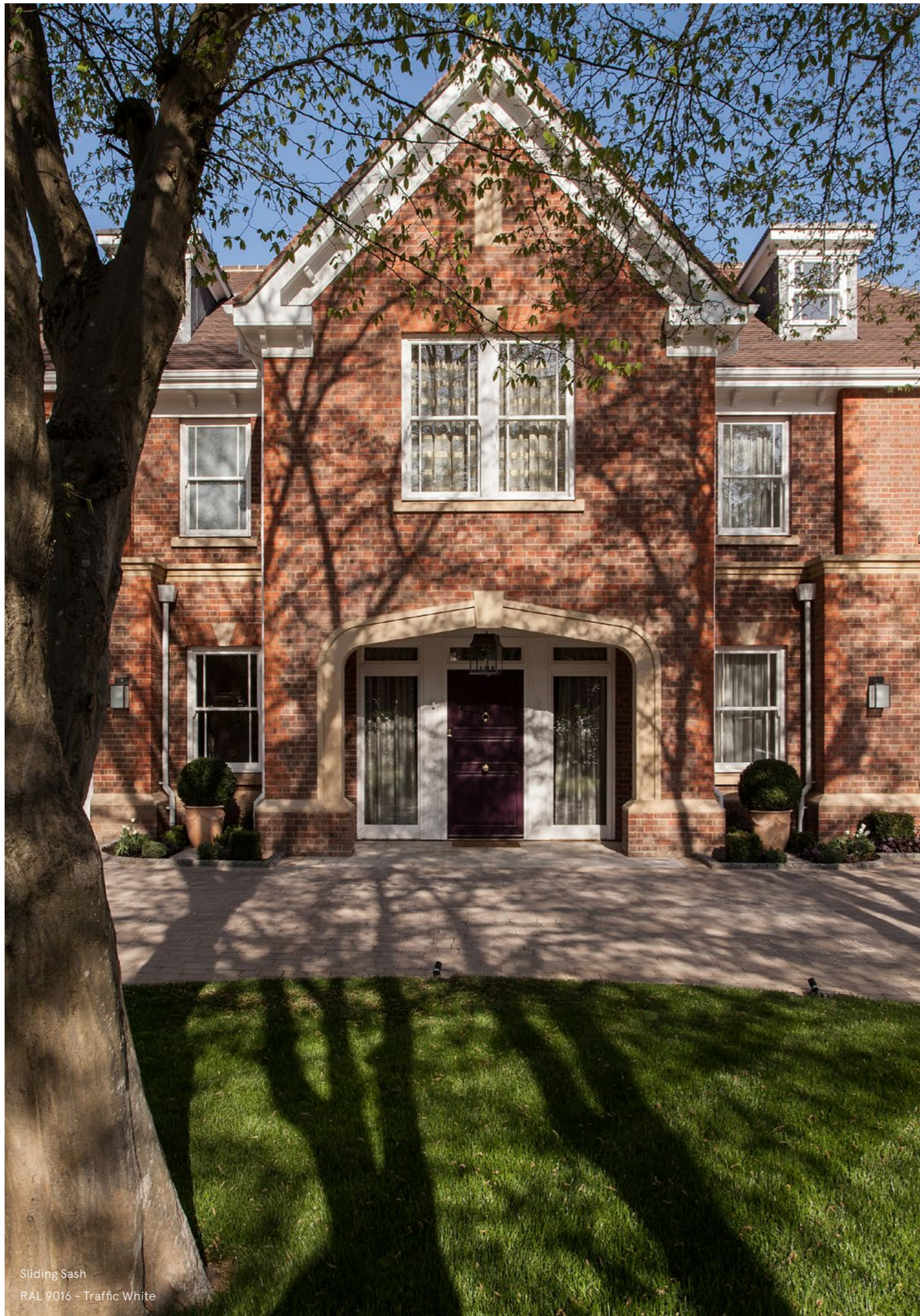
Sliding Sash RAL 9016 - Traffic White