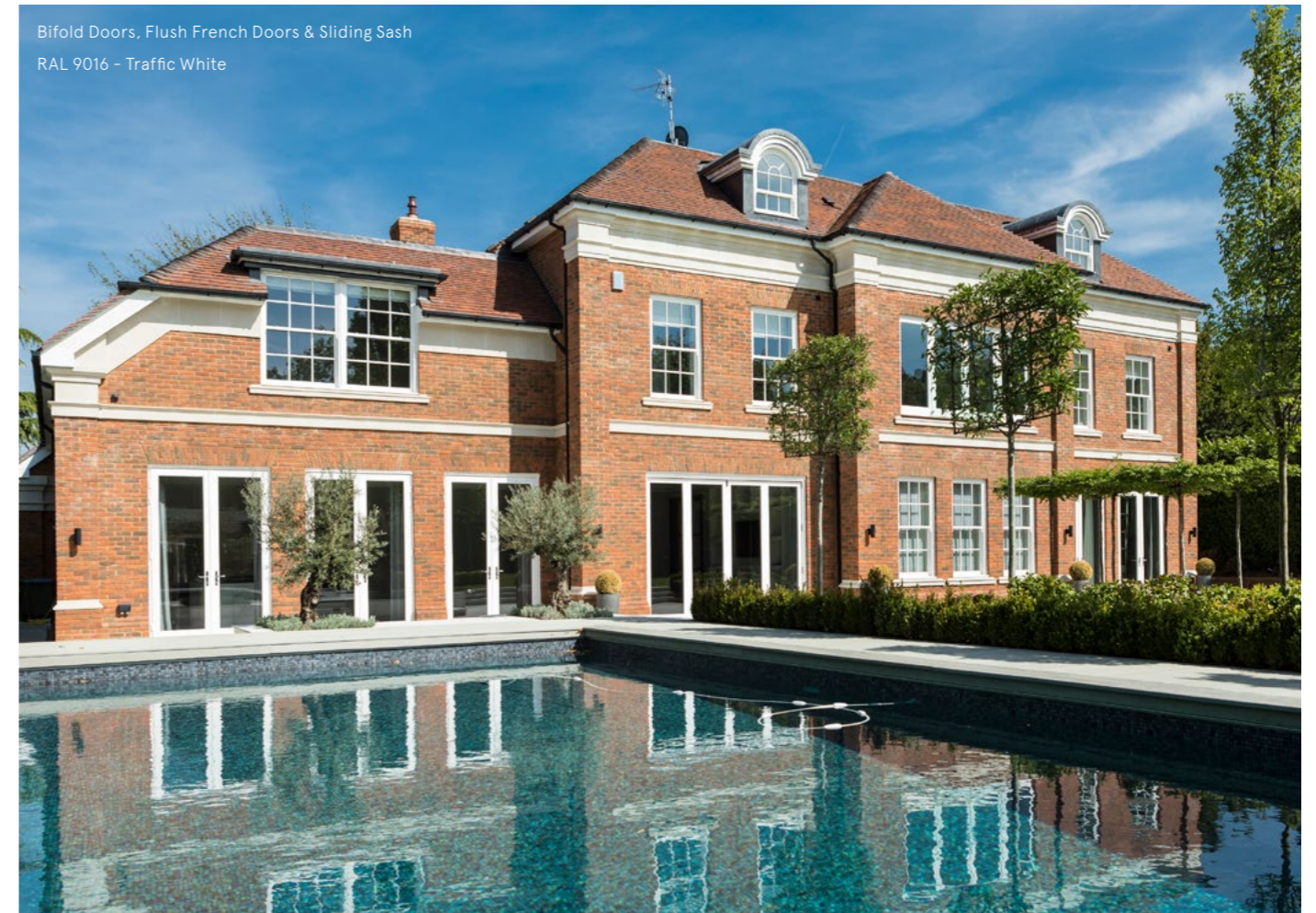
Bifold Doors, Flush French Doors & Sliding Sash RAL 9016 - Traffic White