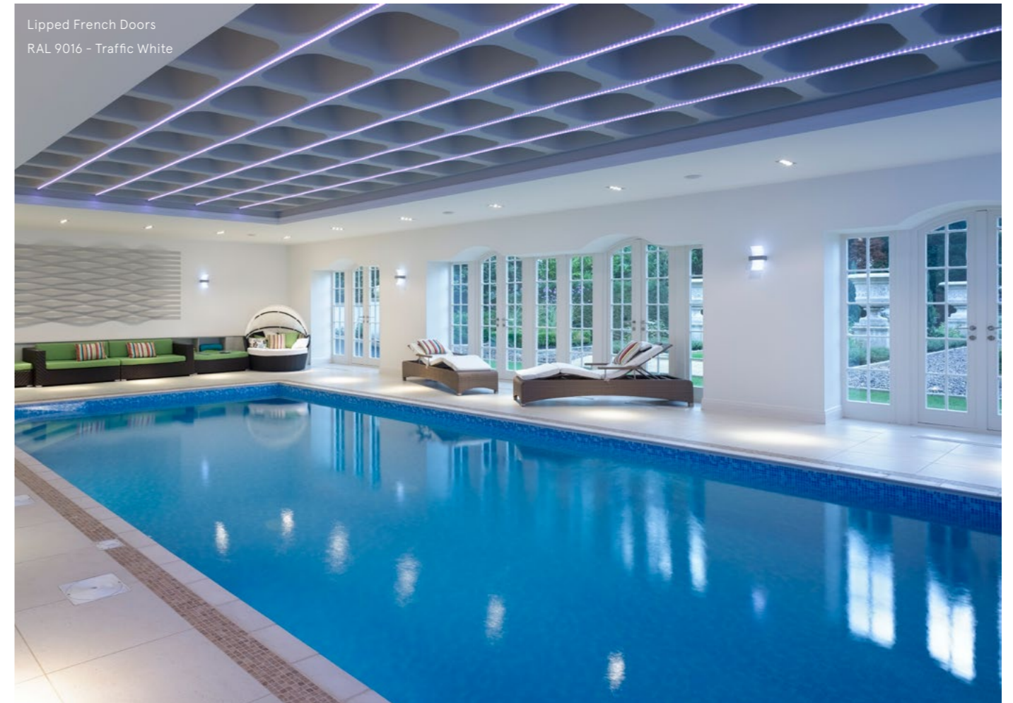
Lipped French Doors RAL 9016 - Traffic White