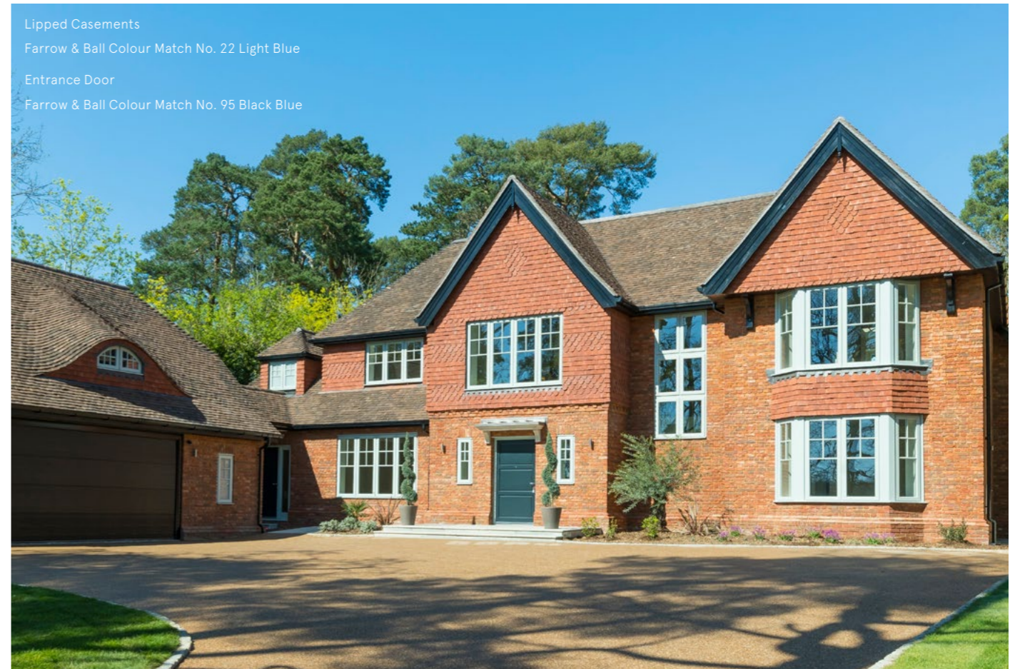
Lipped Casements Farrow & Ball Colour Match No. 22 Light Blue Entrance Door Farrow & Ball Colour Match No. 95 Black Blue