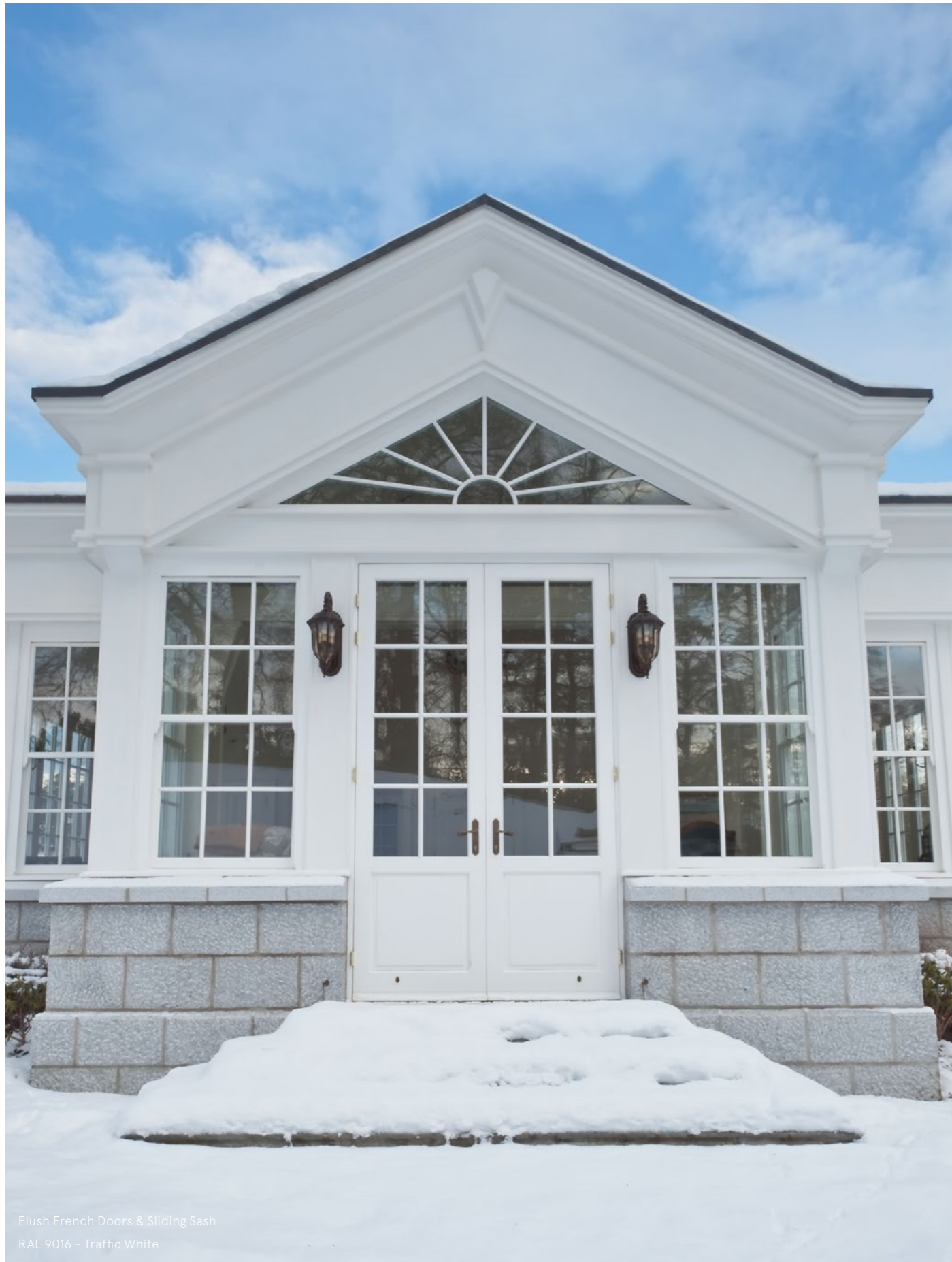
Flush French Doors & Sliding Sash RAL 9016 - Traffic White